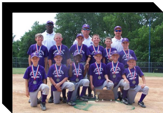
2007 DOMINATORS 11s MAJOR/AAA NEBRASKA STATE CHAMPIONS 2005 & 2006

On behalf of our coaches, families, and, most of all, the players, thank you for your consideration and support. It is sincerely appreciated!